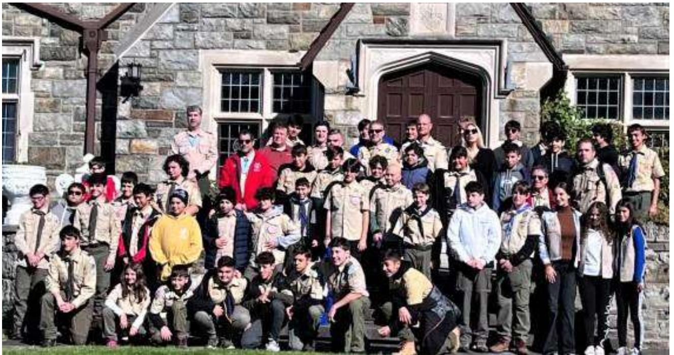
St. Basil's retreat closing ceremonies above and below