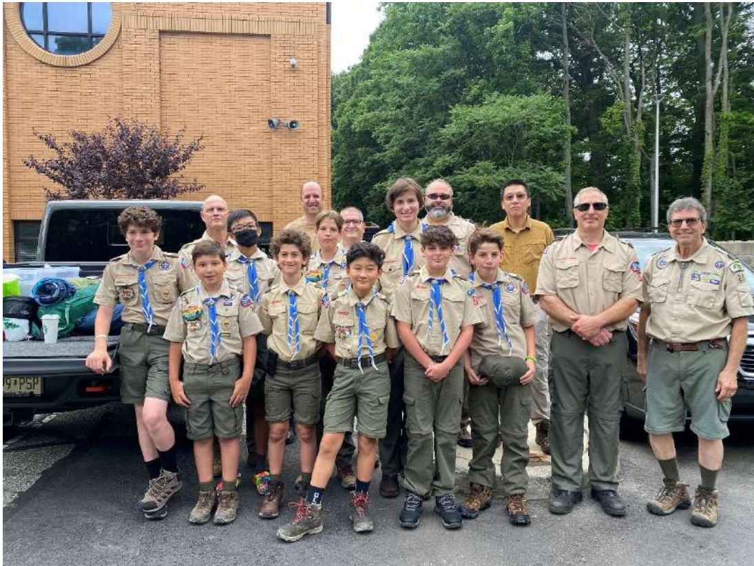
On the way to Summer Camp