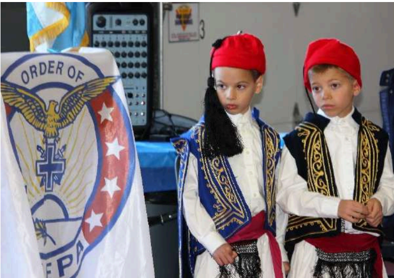
Below: The AHEPA/ Englewood Cliffs Sponsored Greek Independence Day Flag Raising Ceremony at the Englewood Cliffs Firehouse.